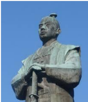
A former samurai ruler of Uto