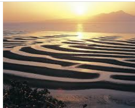
Okoshiki beach in Uto City