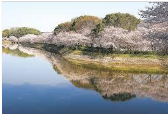
Cherry blossoms in Uto City

Uto Senior high School is located in Uto City, which is situated just south of the prefectural capital; Kumamoto City. Uto City is lucky enough to be able to meet the urban needs of the people as well as provide a relaxing atmosphere, thanks to its beautiful natural environment. This district enjoys diversified industries, convenience of transportation, cultural and historical sites, including a world heritage port, and at the same time, a calm and peaceful environment for education.