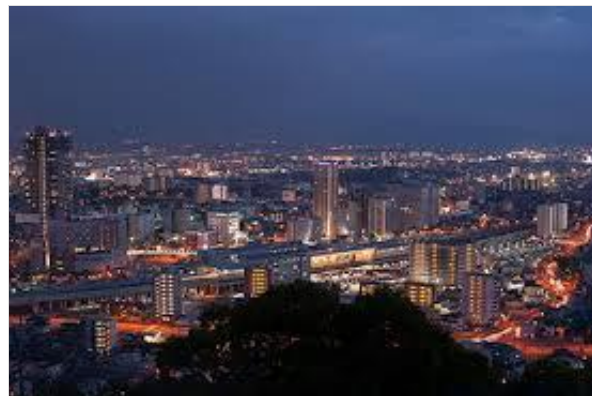
Kumamoto City at night